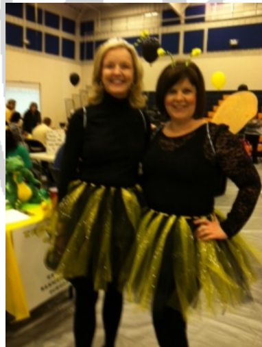
Spellers from Trenton United Methodist Church