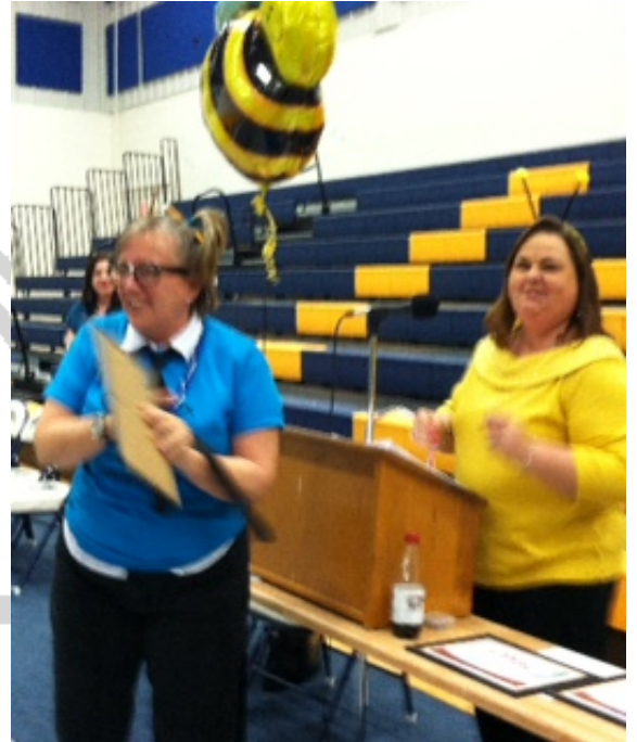
Spelling Bee - Spirit Award Winner Trenton Elementary