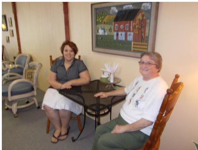
OUR 2 NEW INDUCTEES AT THE ORIENTATION TEA AT GYPSY'S CAFÉ SPONSORED BY THE MEMBERSHIP COMMITTEE.