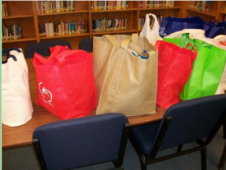
DONATIONS OF NON-PERISHABLE ITEMS COLLECTED FOR RCS IN NEW BERN

If you have any stories or items to contribute to the newsletter, please send me an email or call. Any member news is greatly.