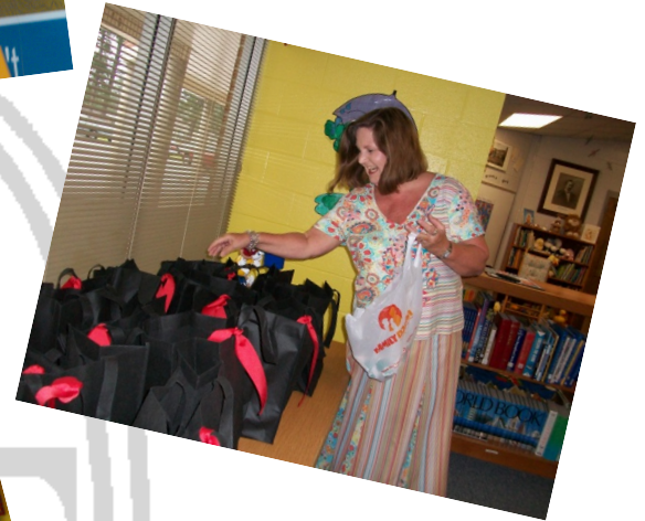
Gamma Epsilon Sisters with the bags given to teachers new to Jones County Schools.